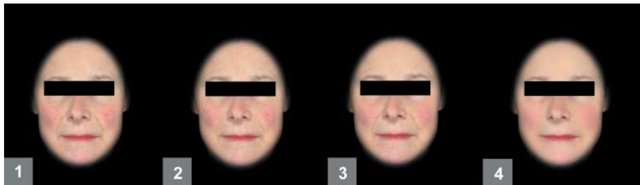
fig. 1 Sample stimulus image series of face Sets 1 to 4. Set 1, original (unmodified) faces; Set 2, faces with skin topography cues removed; Set 3, faces with skin colour smoothed; Set 4, faces with skin topography cues removed and skin colour smoothed.